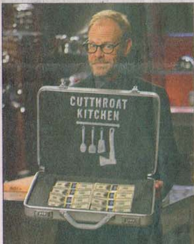
Alton Brown hosts "Cutthroat Kitchen" on the Food Network.

On a recent episode, sour apple candies were swapped for fresh apples for a pork chops with applesauce course. Another chef lost all of her cooking instruments, including pots and pans, and had to prepare her dish by molding aluminum foil into culinary gadgets.